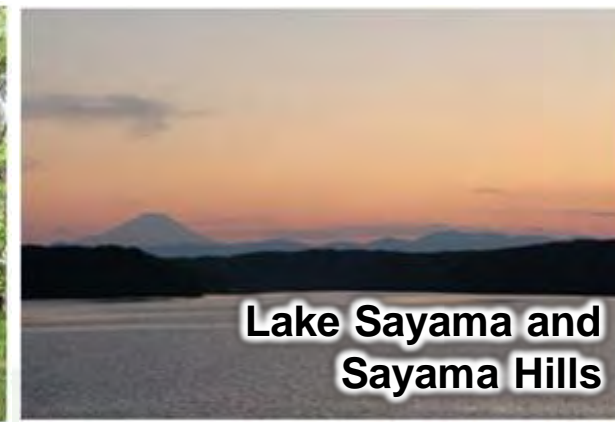
Lake Sayama and Sayama Hills