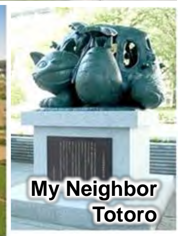
My Neighbor Totoro