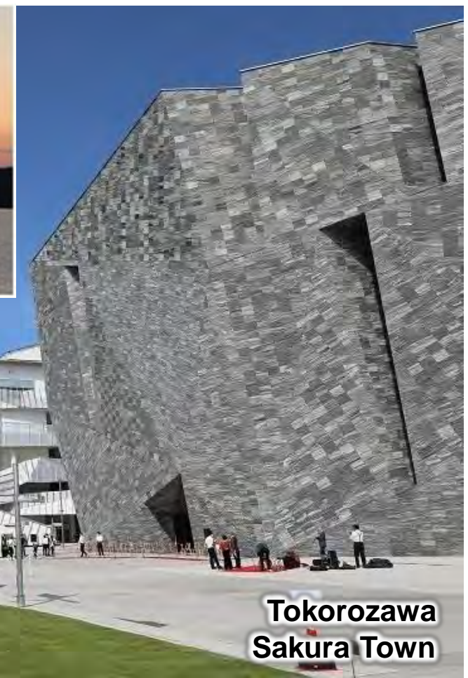
Tokorozawa Sakura Town