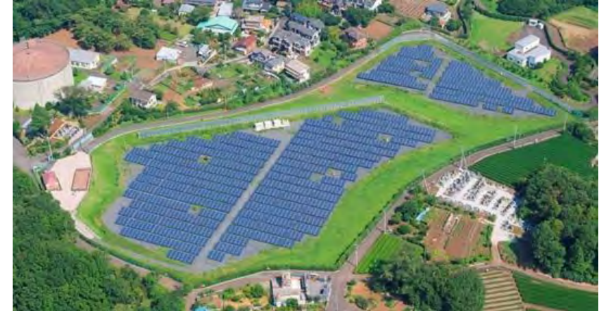
Solar Panels on Waste Landfill (2014)