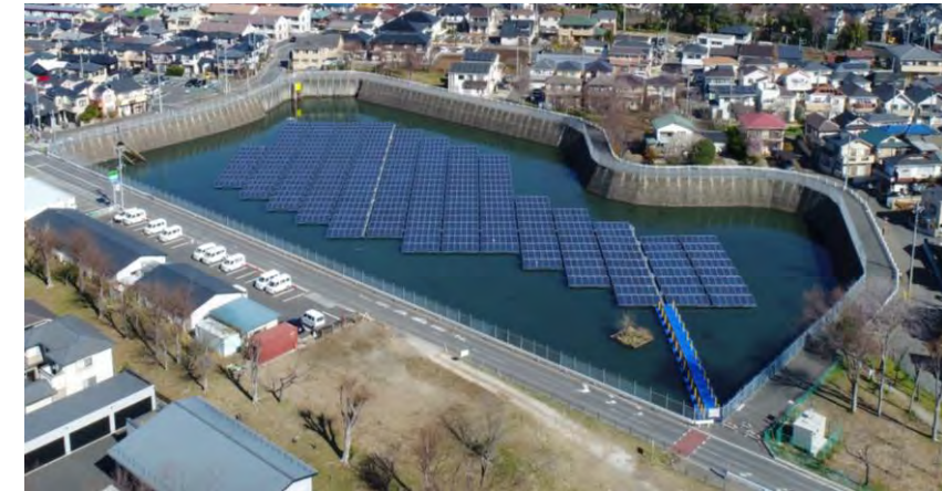
Solar Panels on Retention Basin (2017)